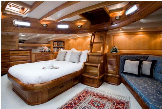
Master view 1