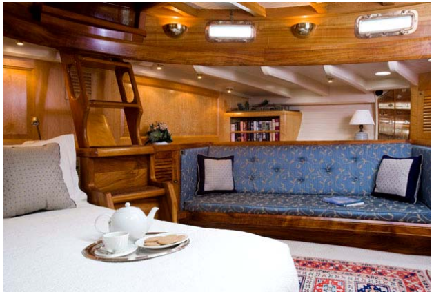
Master view 2