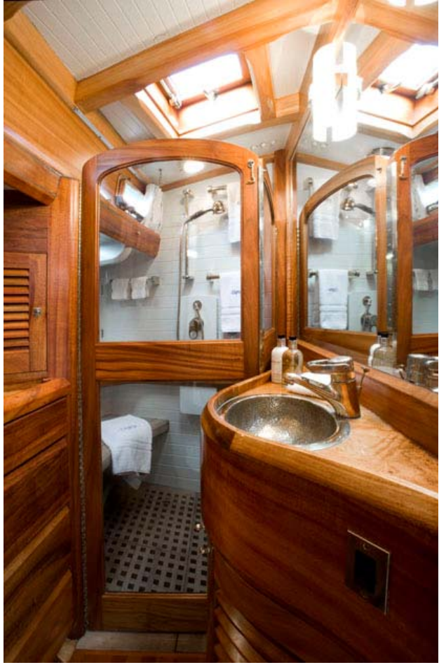
Master Shower room