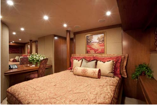
Port Guest Queen