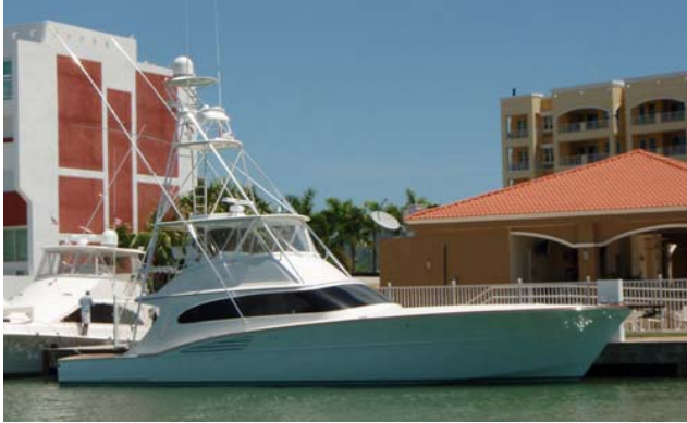
Ambush at xtra rate