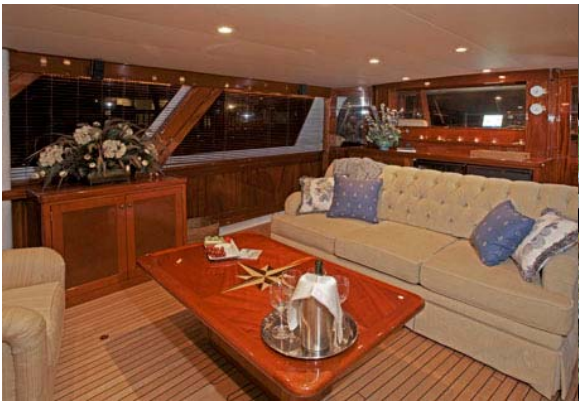
Aft deck salon forward view