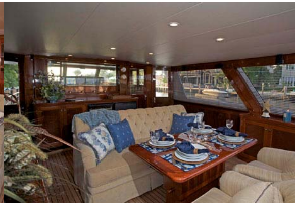
Aft deck salon dining