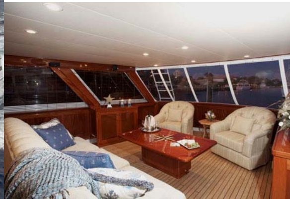
Aft deck salon aft view