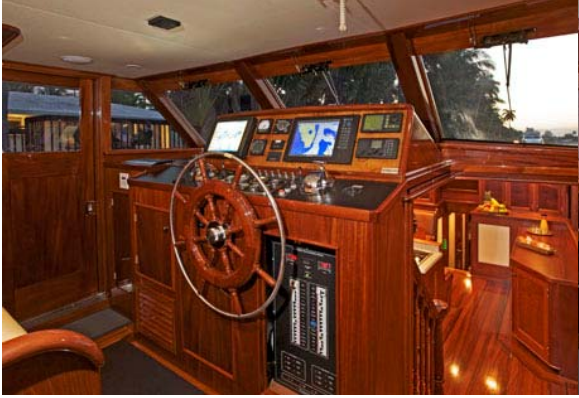
Wheelhouse and galley access