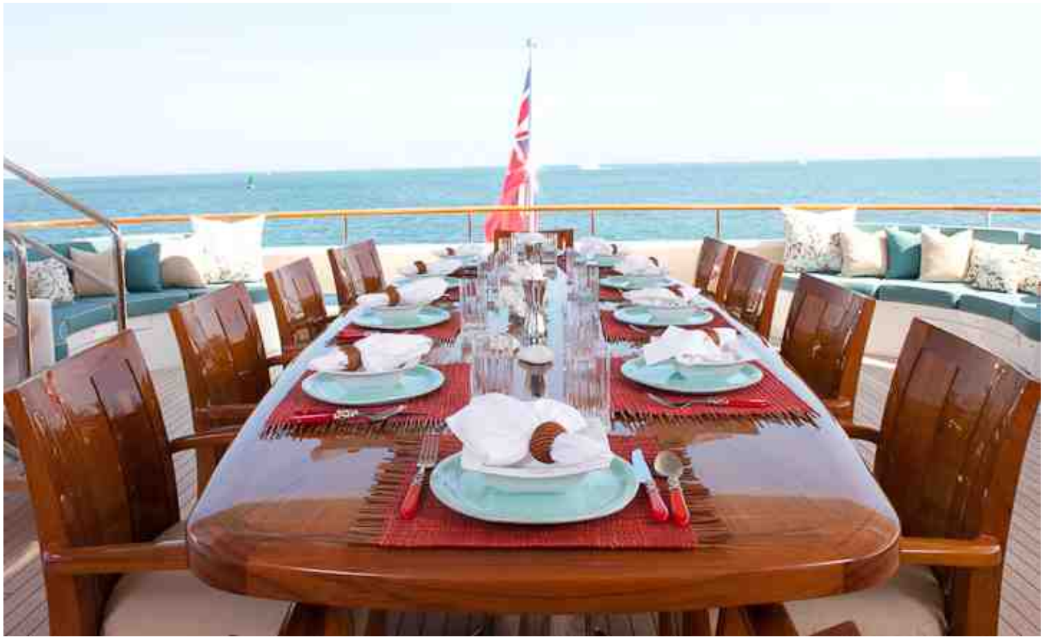
Upper deck dining aft