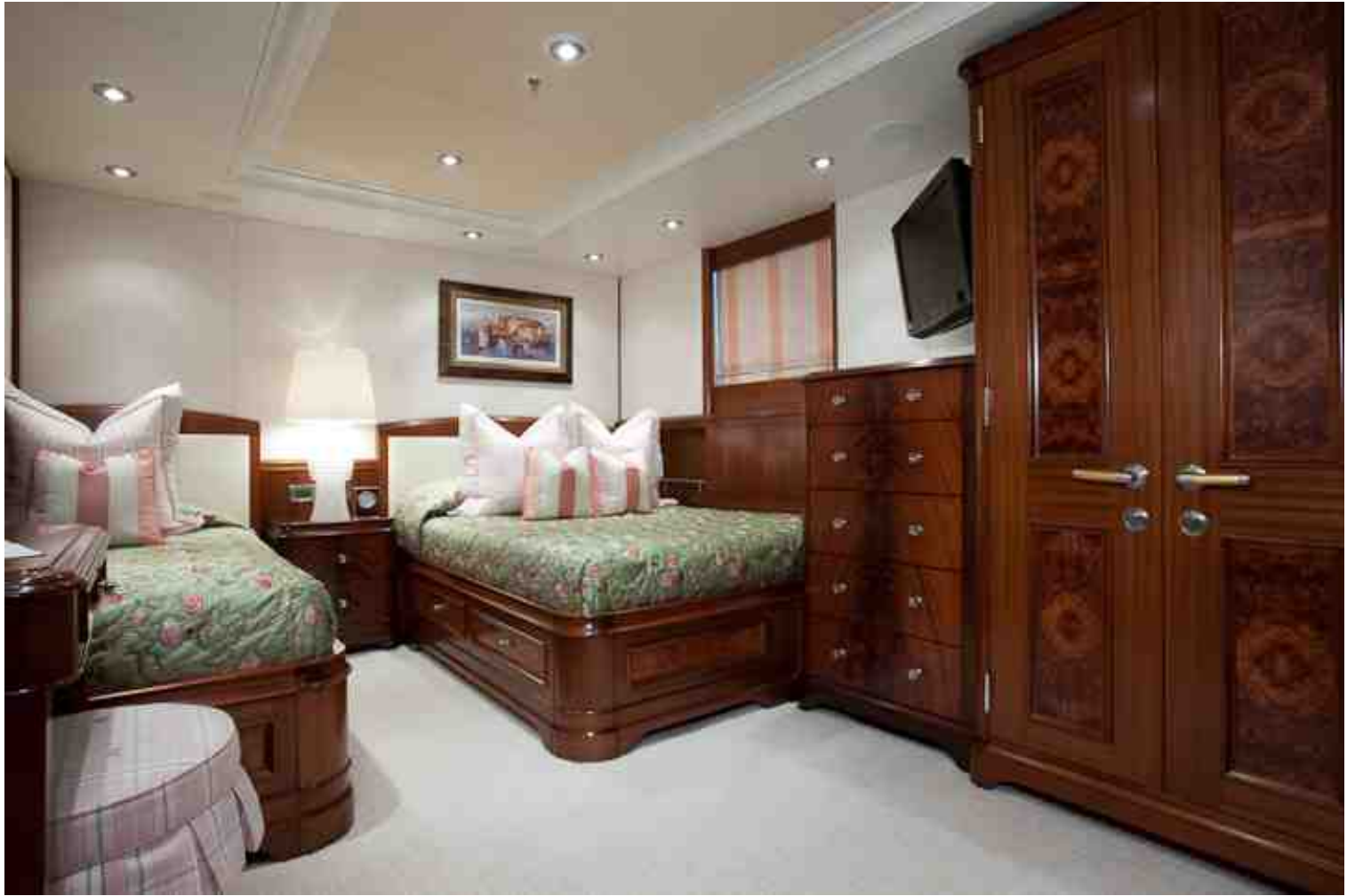
Katya guest room