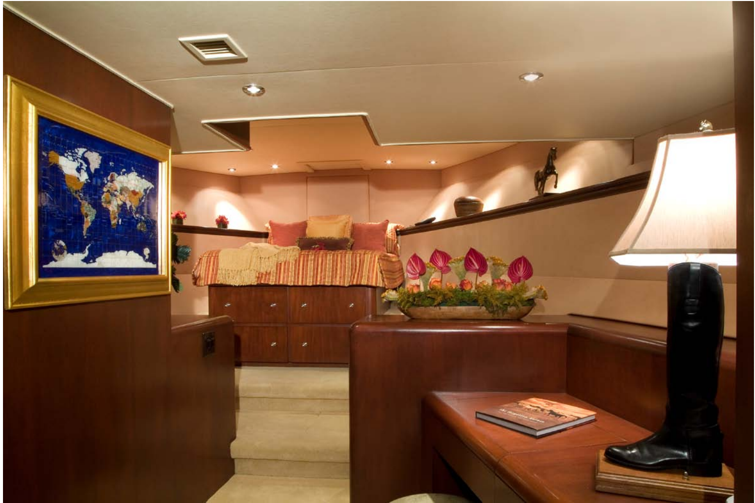
Guest Stateroom Fwd