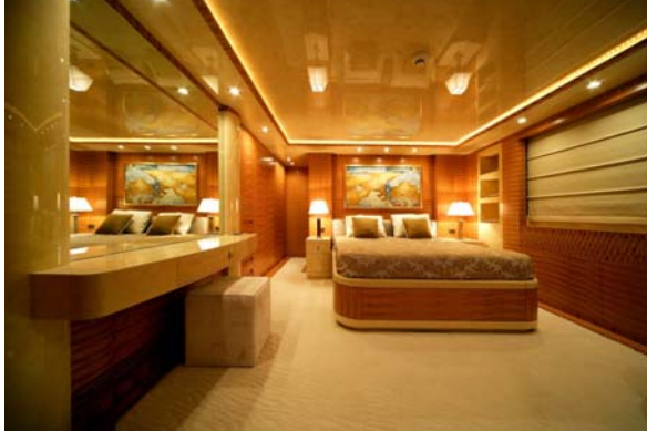
double cabin 2