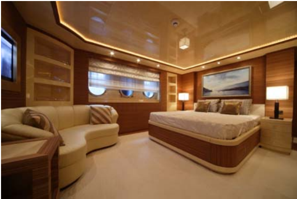
double cabin 1