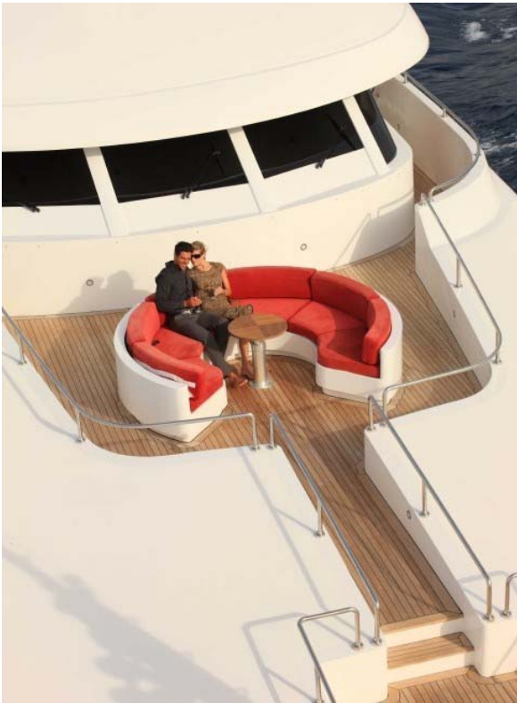
ext seating 1