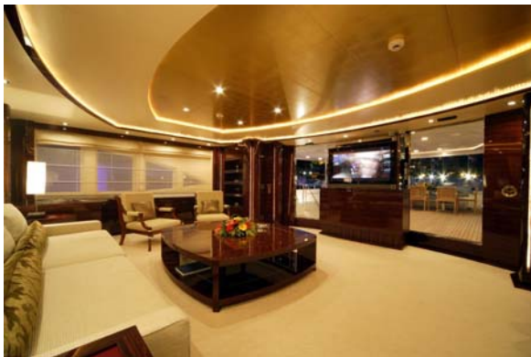
Middeck Salon 2