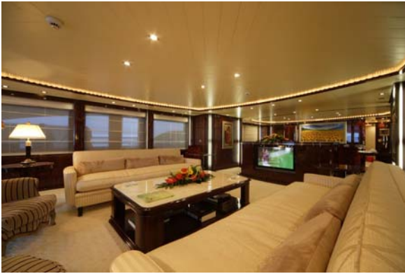
main salon 2