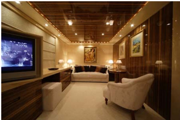
double cab 4