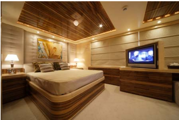
Double cab 3