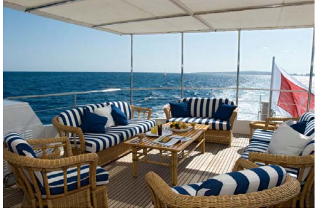
Upper Deck 3