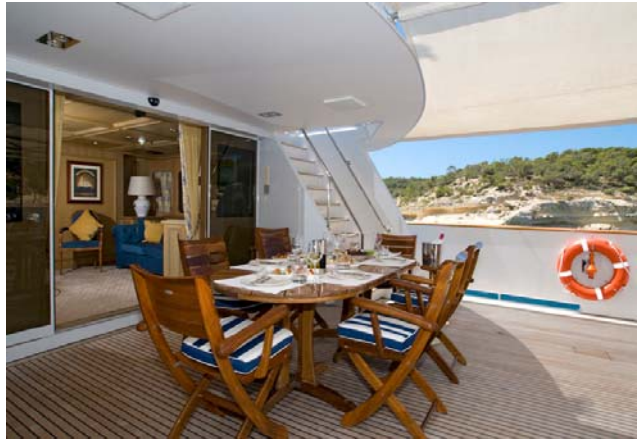
Upper Deck 2