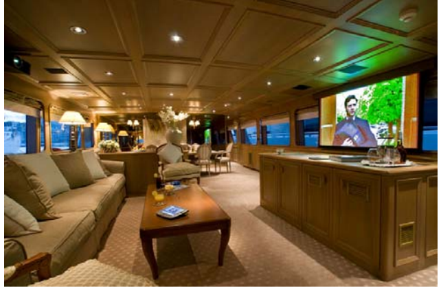
Salon with cinema screen