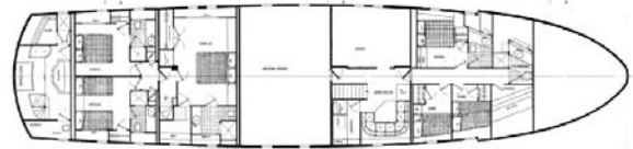
Layout Below deck