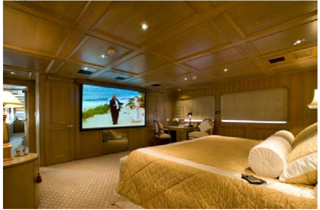
Master Cabin 2