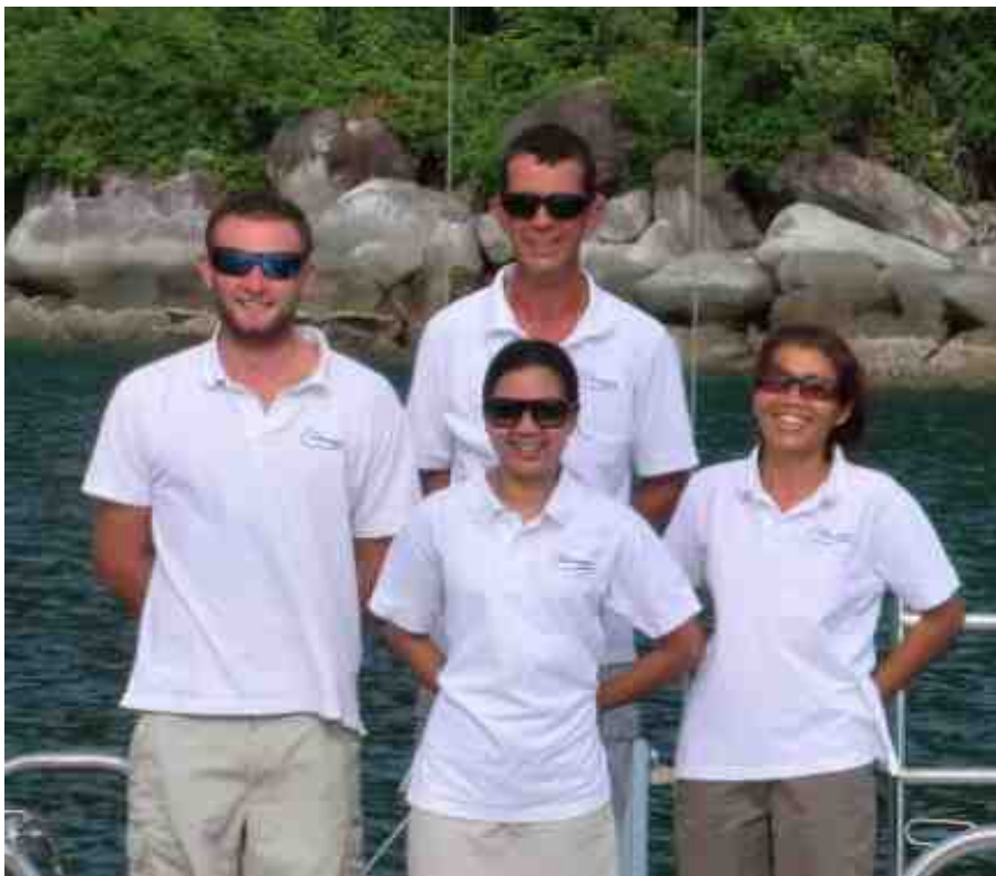
This crew welcomes you on board TARONGA - Dec 2011