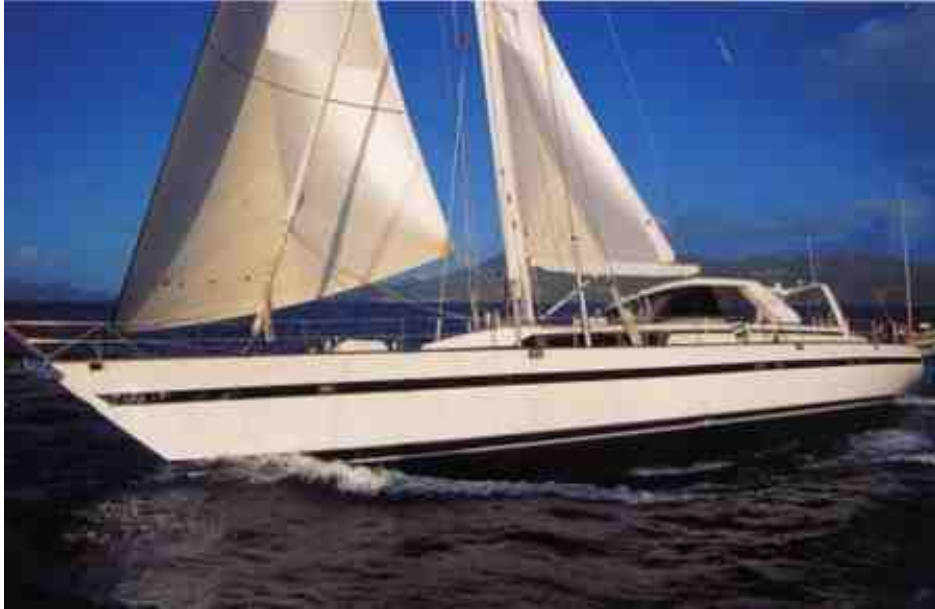
The crew welcomes you on board TARONGA - Dec 2011