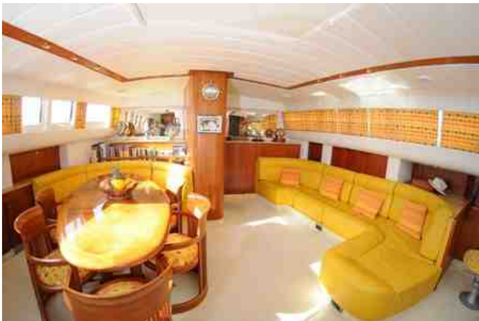
Saloon, incl. Dining