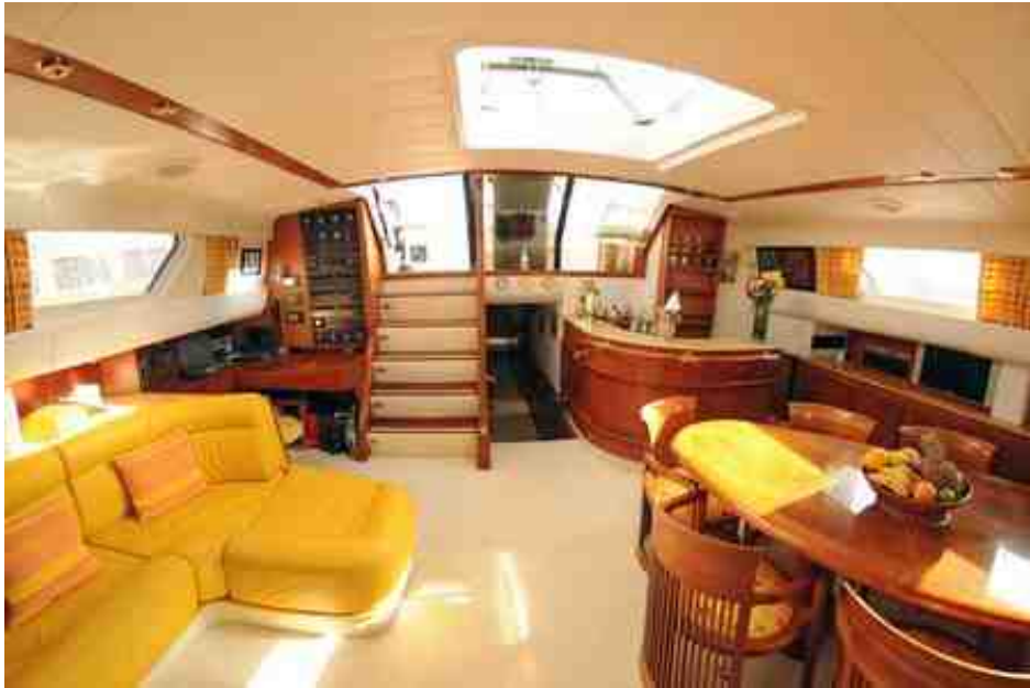
Saloon incl. Bar